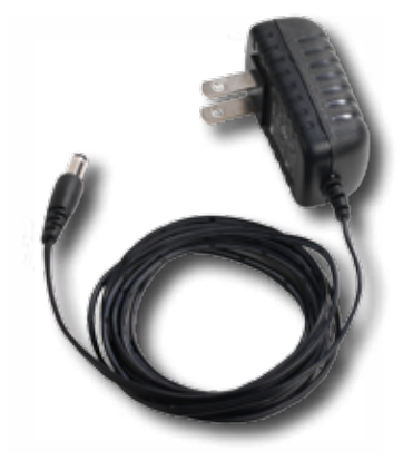
12V DC Power Adaptor