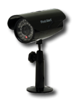
CM420 420 TVL Camera