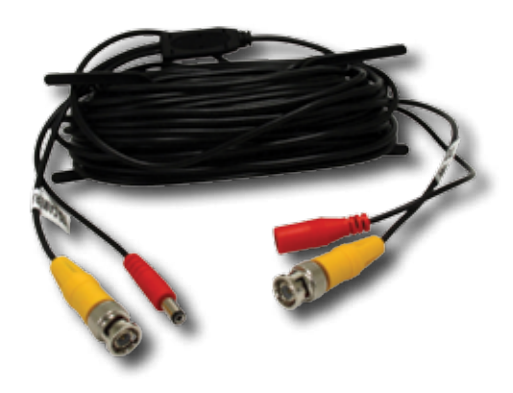
75' BNC Video & DC Power Cable

©2011 BRK Brands, Inc. a Jarden Corporation company (NYSE:JAH) www.brkelectronics.com