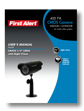
Quick Install Guide